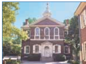
12 CARPENTERS' HALL The birthplace of the American identity