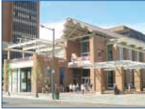
1 INDEPENDENCE VISITOR CENTER Your adventure begins