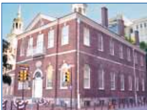
6 CONGRESS HALL The former U.S. Capitol and site of two Presidential Inaugurations