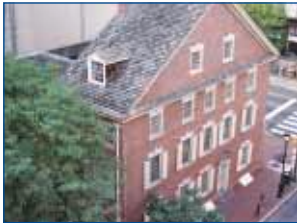
2 DECLARATION HOUSE Where Thomas Jefferson wrote The Declaration of Independence