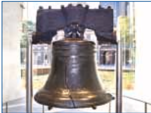
4 THE LIBERTY BELL The quintessential icon of American freedom