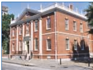
10 LIBRARY HALL The nation's first public library and the former Library of Congress