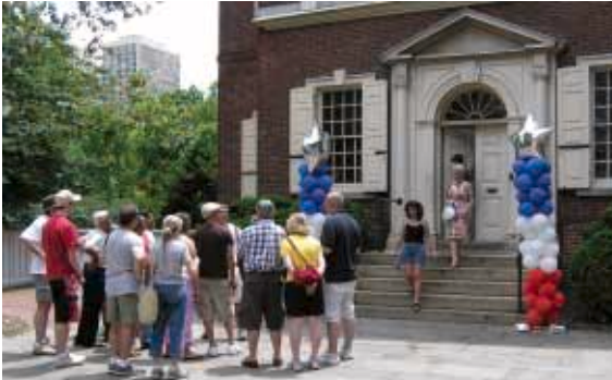
The Constitutional Guided Walking Tour at Carpenters' Hall

Experience Philadelphia's best sightseeing tour! Frequent departures through the day from the Independence Visitor Center, 6th & Market Streets. See more than 20 historic sites such as the Liberty Bell and Independence Hall on a 1.25 mile, 75 minute outdoor walking adventure! Tickets are $17.50 per adult and $12.50 per child (ages 3-12). For tickets, call 215.525.1776, visit PhillyWalk.com or go to the Visitor Center at 6th & Market Streets.