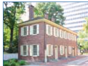
13 NEW HALL MILITARY MUSEUM Interpreting the role of the military in early U.S. history