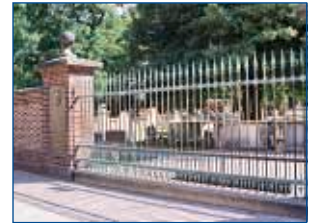
19 CHRIST CHURCH BURIAL GROUND The final resting place of Benjamin Franklin