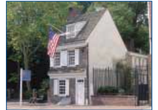
17 BETSY ROSS HOUSE Where Betsy Ross sewed the first Stars and Stripes