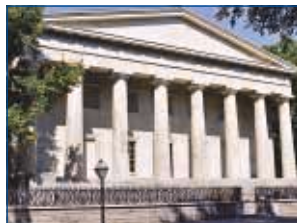
11 SECOND BANK OF THE UNITED STATES One of the most influential financial institutions in the world, now a portrait gallery