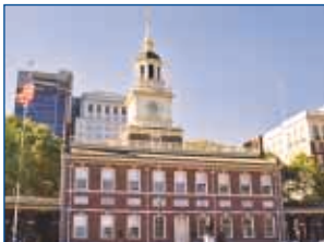
5 INDEPENDENCE HALL America's Birthplace