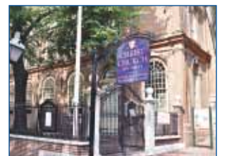
16 CHRIST CHURCH An active parish since 1695, often called the "Nation's Church"