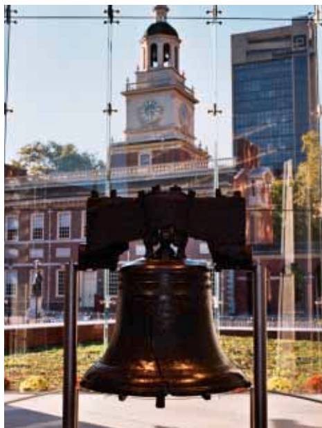
The Liberty Bell with Independence Hall in the background