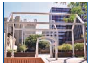
15 FRANKLIN COURT & B. FREE FRANKLIN POST OFFICE Ben Franklin's home and the only Colonial-themed Post Office