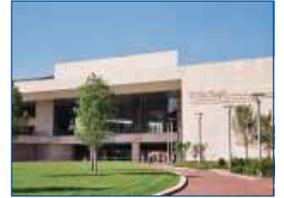
20 NATIONAL CONSTITUTION CENTER Exercise your right to explore the Constitution of the U.S.