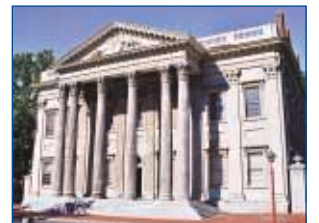
14 THE FIRST BANK OF THE UNITED STATES Sparked the first great Constitutional debate