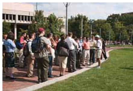
The Constitutional Guided Walking Tour at the National Constitution Center

The Constitutional is an outdoor walking adventure that provides a primary overview of the Independence Park area including sites such as the Liberty Bell , Franklin Court and the Betsy Ross House . Come see why the Chicago Tribune has stated, "No visit to Philadelphia is complete without taking a Constitutional Guided Walking Tour, a 75-minute, mile and a quarter stroll that puts 15 historic sites, from Independence Hall to the National Constitution Center, and Ben Franklin, in perspective."